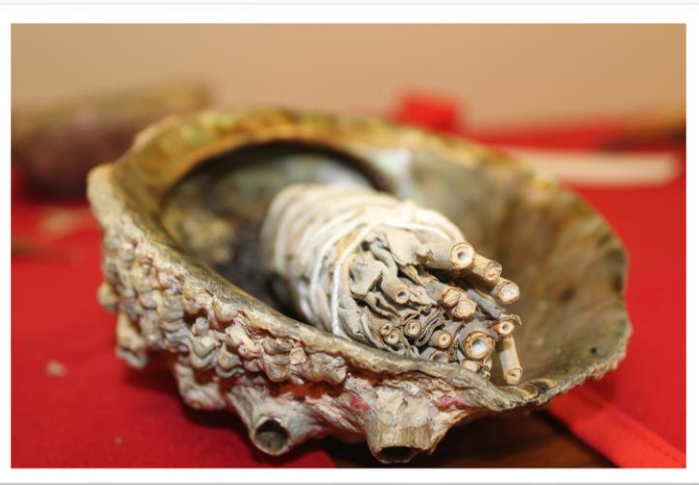
Smudge bundle at our King Street location

This week we want to include some important items that you may not have considered up until now. Along with food and hygiene staples, we want to highlight the need for medicines used in ceremony and reflection such as sage, cedar and sweetgrass . It cannot be overstated how vital and beneficial ceremony can be when it comes to maintaining emotional health at this time. If you have any kind of donation to help us with our outreach, please call 204-925 0300 .